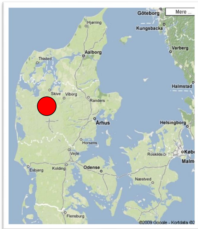
Skive Municipality: 47.000 Citizens