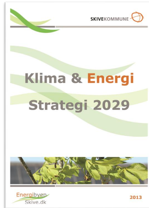
Climate and Energy Strategy 2029